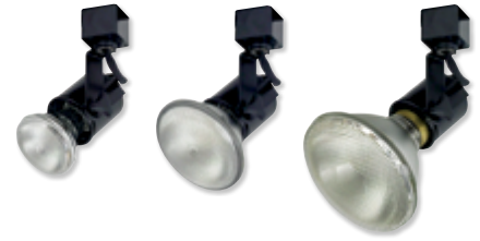
shown with PAR20