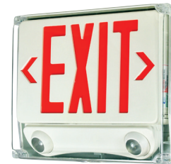
NEX-730-LED/R & NEG-60

Exit & Emergency Combo with Wet Location Enclosure